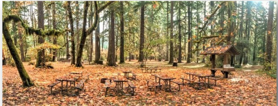
Group Camping area at Cascadia State Park.

W elcome to Linn County! Now that July is here, it appears that summer has finally arrived.