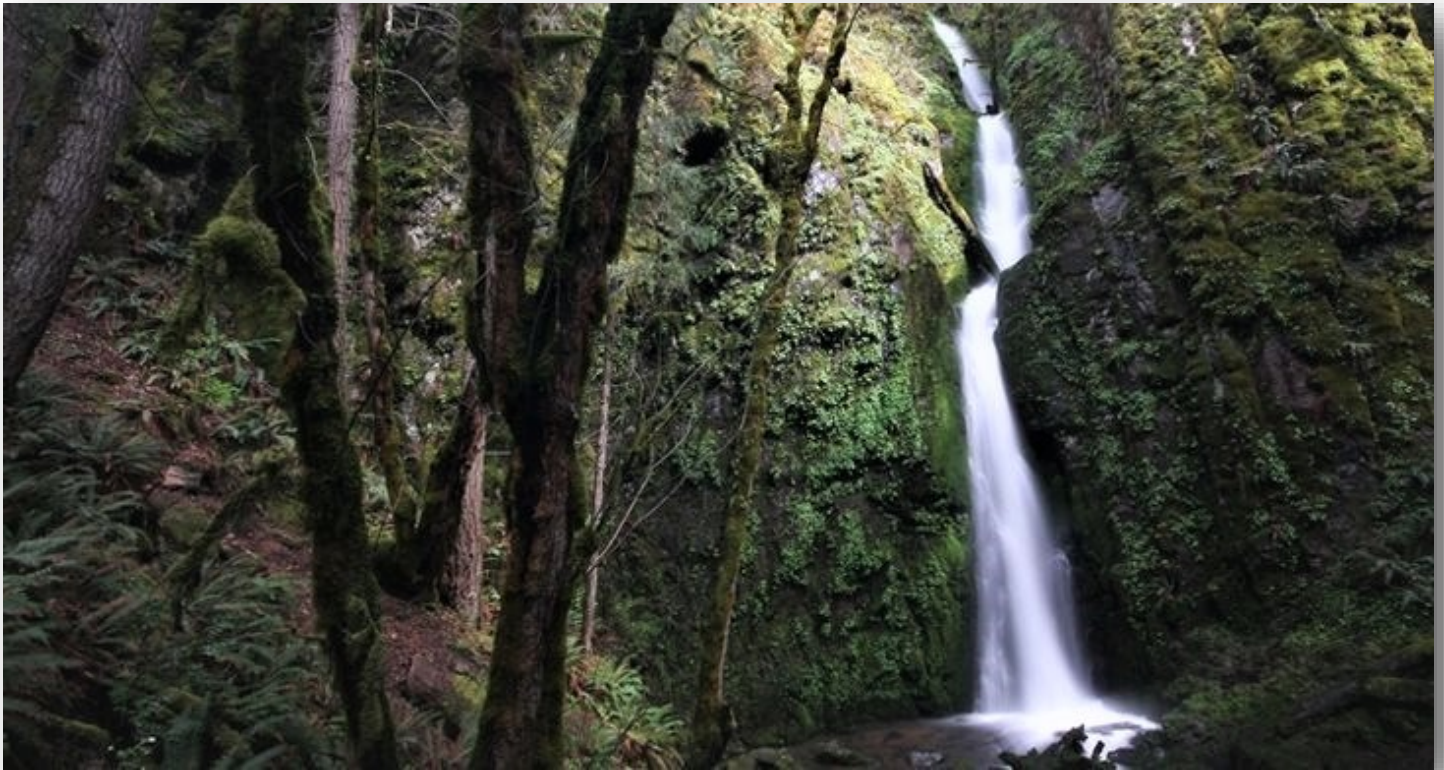
Soda Creek Falls at Cascadia State Park.