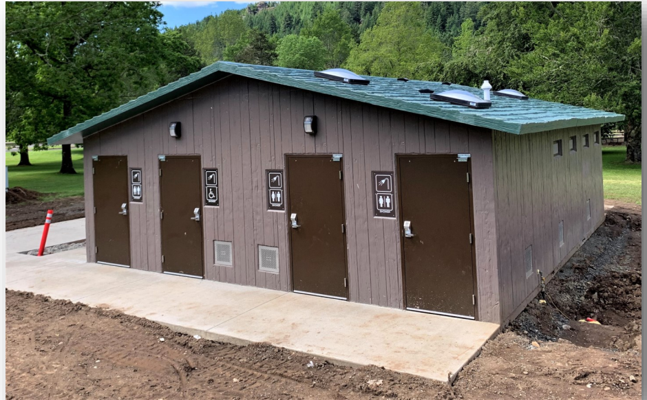
The new restroom and shower building has been installed at Sunnyside County Park.

Waterloo County Park has seen several improvements over the past three years including a new public water system completed in 2019 and a new playground completed in 2021. The new water system included drilling a new well, adding a storage and treatment system, as well as new distribution lines. The new playground replaced the previous 25-year old playground, which was heavily vandal-