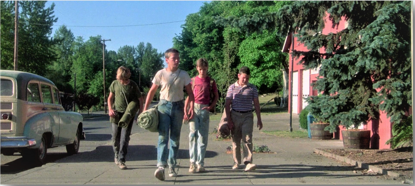
The always popular Stand By Me Day in Brownsville July 23 will include self-guided tours.