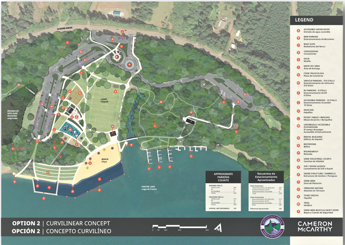
Lewis Creek County Park Master Plan Option II.