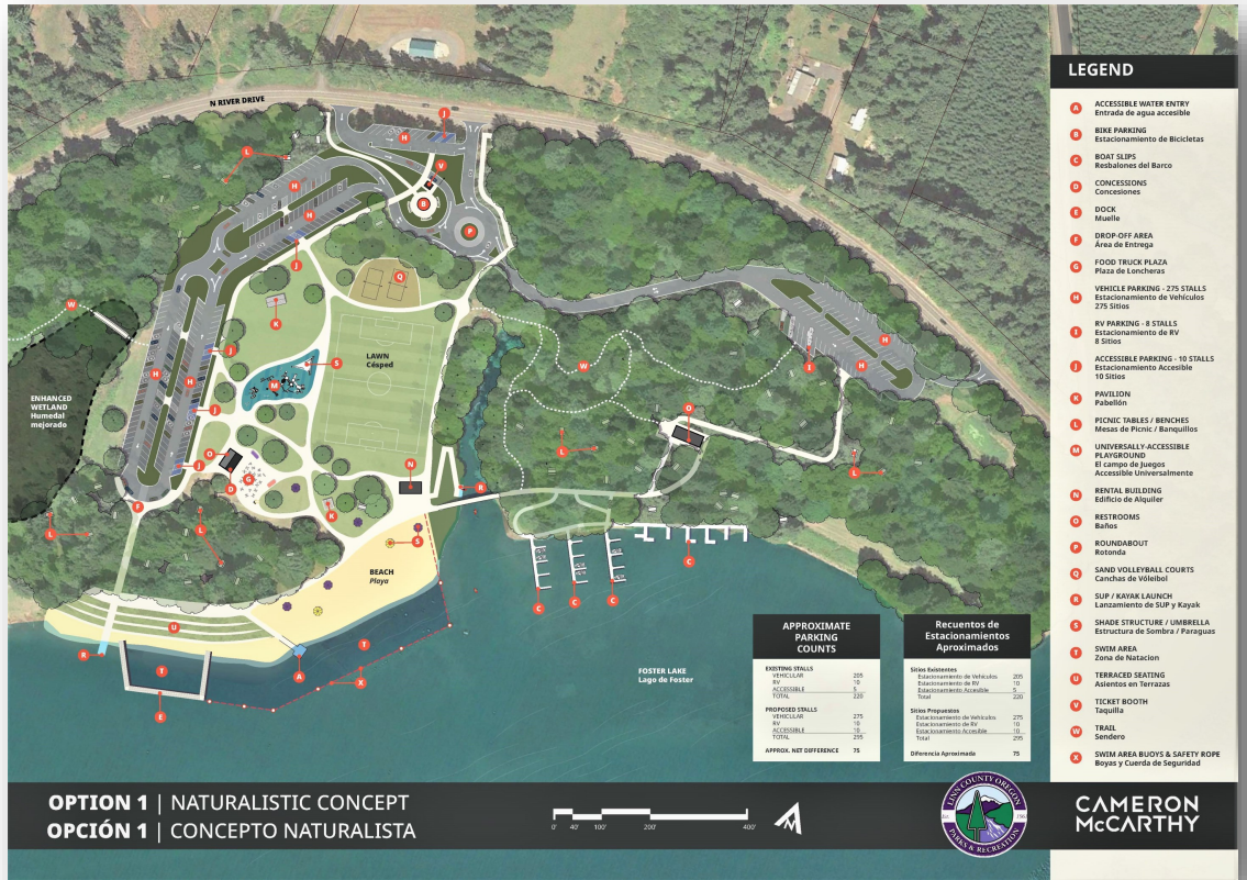
Lewis Creek County Park Master Plan Option 1.

Take the Lewis Creek Park survey at linnparks.com/ or visit https://qaz1.az1.qualtrics.com/jfe/form/SV_2uCkSZIDMZ63iiW